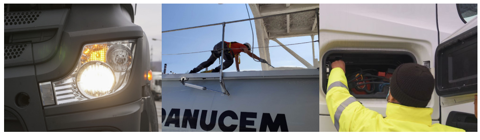
Functionality of the lights