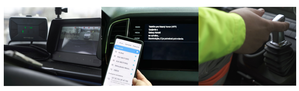
Reversing camera system